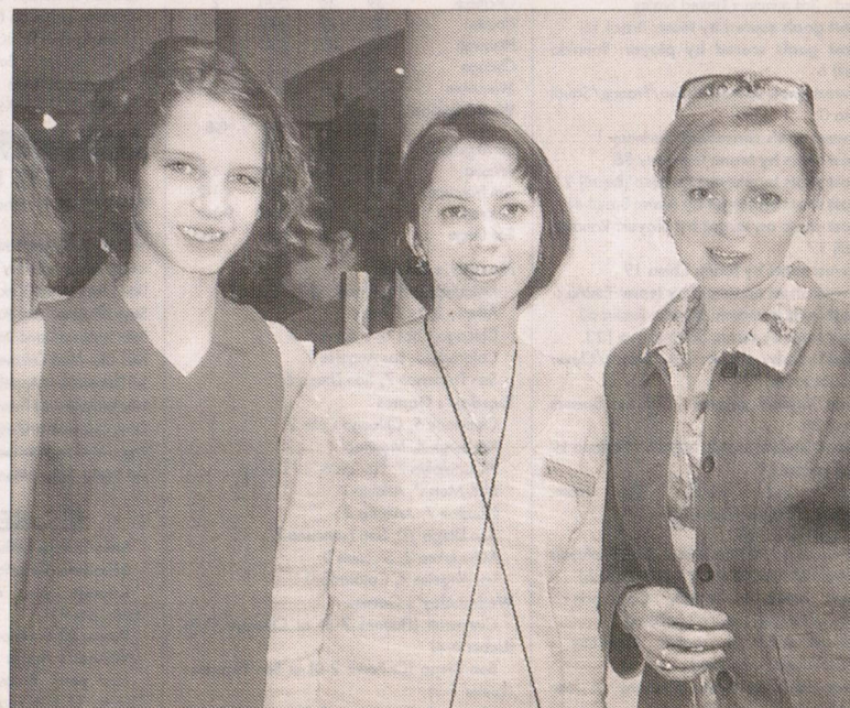
The competition at the Marriott brought many children and their parents to Moscow.

Framed pictures of the winners were displayed in the